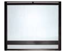
FOLIO-36 (Does not overlap)

Finishes Five rich finishes. High on style, long on durability. Available on select fronts.